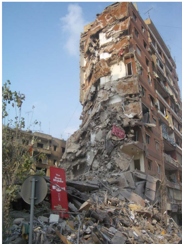
A rapid waste assessment helped determine identify the composition of waste and supported response planning.

This goal was hampered by the land, air and sea blockade on Lebanon. UNEP's Executive Director brokered an agreement whereby the Israeli