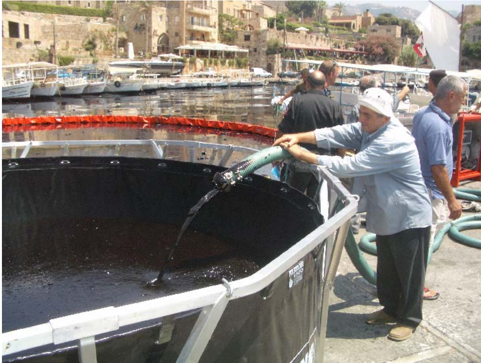
Oil spill clean-up activities in Lebanon: acute needs have been met, but longer-term challenges remain.

sections and programmes - such as the Regional Office for West Asia (ROWA), Chemicals and the Mediterranean Action Programme - OCHA, UNDP, IMO, as well as REMPEC, EC, IUCN, Greenpeace and others. These calls proved to be a valuable tool, providing a forum for information sharing, and helping to maximize the effectiveness of efforts and avoid overlap.