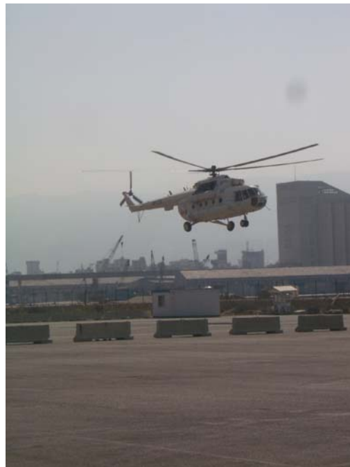
A helicopter departs for surveillance to support oil spill response planning.

Stakeholder conference calls. Regular conference calls were organised and chaired by the Joint Environment Unit with a wide range of partners including UNEP